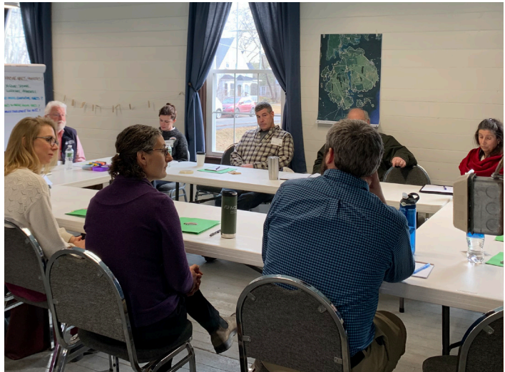
Above: Participants from the St. Sauveur Mountain Team discuss housing needs on MDI.

The following section summarizes the key takeaways that emerged during the Housing Solutions Summit discussions. They are divided into Needs, Barriers, and Solutions.