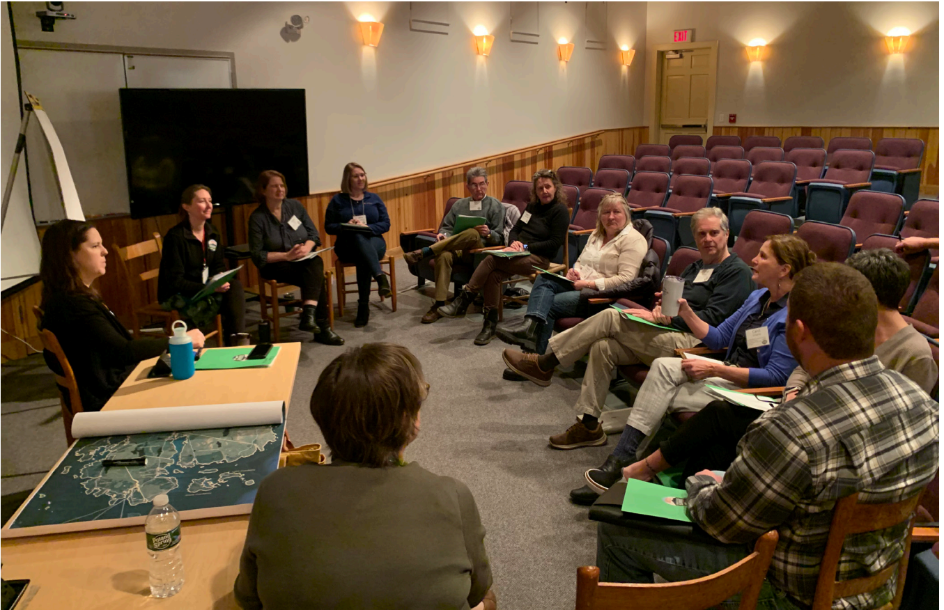
Above: Participants from various teams share their stories about housing needs and barriers, and brainstorm additional solutions to address these issues on MDI.